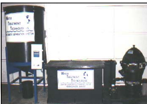
Oil/Water Separators & Above ground clarifiers