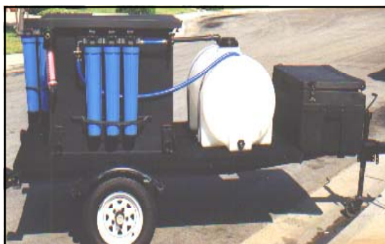
Mobile Water Filtration Units and Water Pickup devices