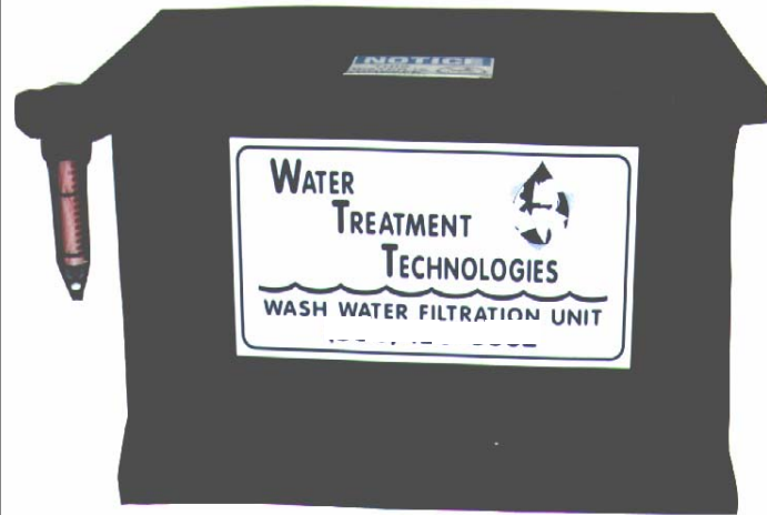
Sewer Discharge Units