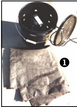
Sump Pump Enclosure & Filter Bag