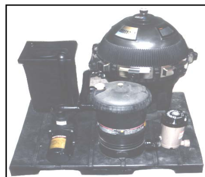
Multi-Media polishing systems & filters