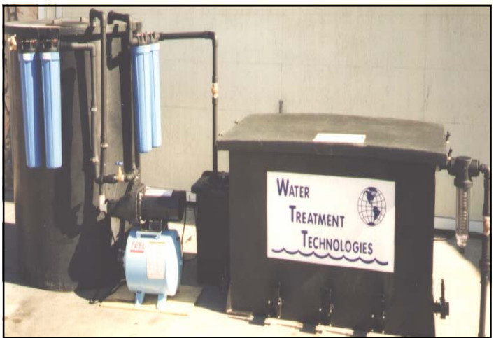
Closed Loop Zero Discharge Systems