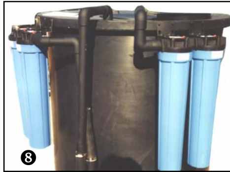
Four Polishing Filters